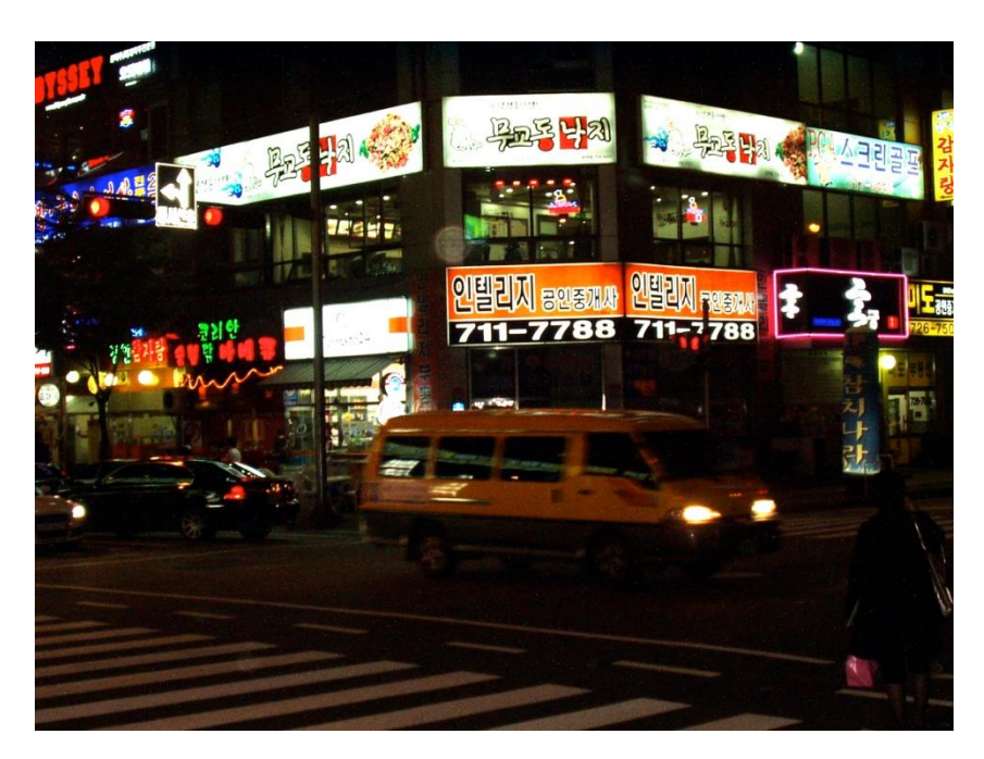
A suburb of modern Seoul at night