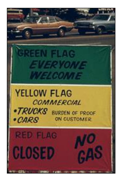
Gasoline dealers in Oregon displayed signs like this during the fuel shortage that followed the Arab-Israeli War in 1973.

The great post-World War II economic boom came to an end in the early 1970s. Both internal and international economic problems unfolded. In the industrialized world, conflicts broke out between labor and capital. Workers' dissatisfaction with the failure of wages to rise led to more strikes. Wages were badly lagging behind economic growth. Inflation was also heating up. The global economy burst into flames with steep rises in oil prices, first in connection with the aftermath of the Arab-Israeli War (1973) and second with the Iranian Revolution (1979). There was also a widespread backlash against multinational corporations. These firms usually had greater resources than the domestic ones that tried to compete with them. The latter complained that the foreign giants dominated local markets and that their managers were not sensitive to local and national culture and values. They hired foreign workers who took the lowest wages. This led to a lowering of wages or to unemployment for local labor. Moreover, large foreign corporations came to acquire political clout that was especially problematic for developing nations.