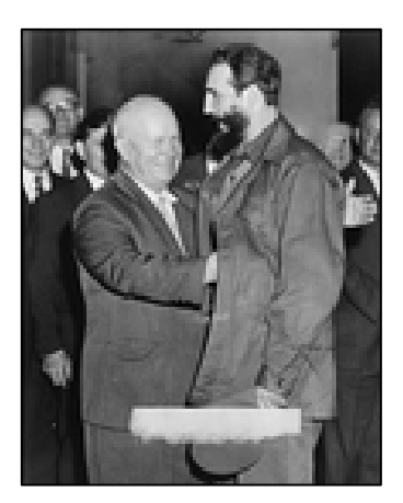
Nikita Khrushchev of the Soviet Union and his Cold War Ally Fidel Castro of Cuba, 1962

drawing then others. Few people, however, have experience tearing construction paper and gluing it. Therefore, this project places everybody on an equal footing. They don't have to worry about their artistic skills; they only have to think symbolically about the relationship between newly-independent states and the superpowers. Provide students with time to complete their projects. After they have completed them, reconvene the class. Invite students to present their projects to their classmates. Encourage students to explain why they thought about the relationship between the superpowers and the newly-independent states the way they did.