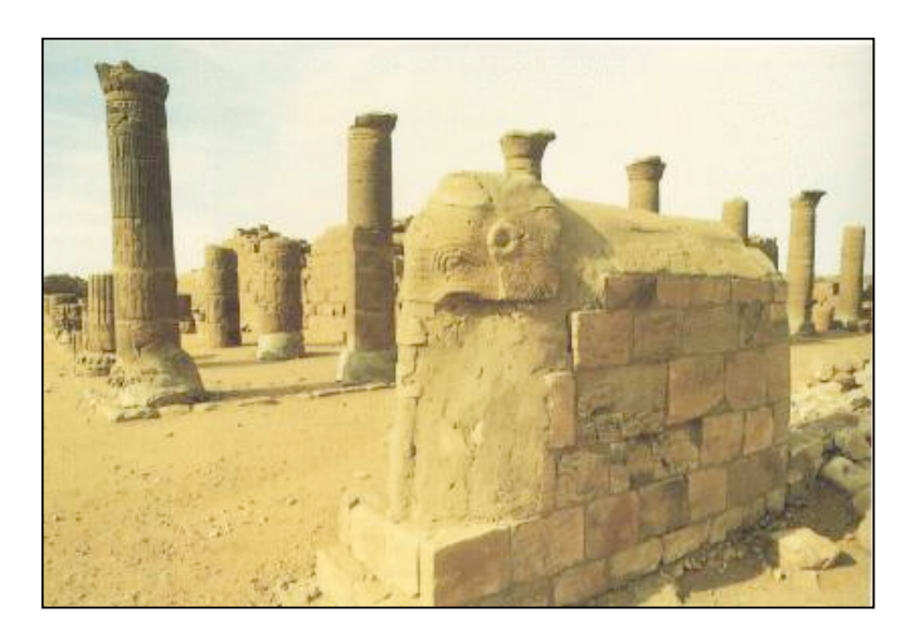
An elephant carved on a wall of the temple of Musawwarat al-Sufra in the kingdom of Kush in what is today Sudan.

Students are rarely objective about their own work, or themselves. People in general are probably the same way. The goal here is to help students become more objective. This is an activity that on the face of it might work as homework, and as it lands at the end of the unit teachers might use it that way for time's sake. But as with the discussion of the Peer Evaluation Rubric above, class time spent on this activity would probably be useful. Have the students work individually in class on the Self-Evaluation. Teachers should walk around and observe the classroom as they do. Perhaps a good number of students, even ones who were perfectly comfortable and accurate in assessing others' work, will "lose their bearings" when evaluating their own work. All sorts of issues—social, personal, or what have you—may stand in the way of a dispassionate self-evaluation. The teacher's message to the students should be the same at all times: focus on the rubric.