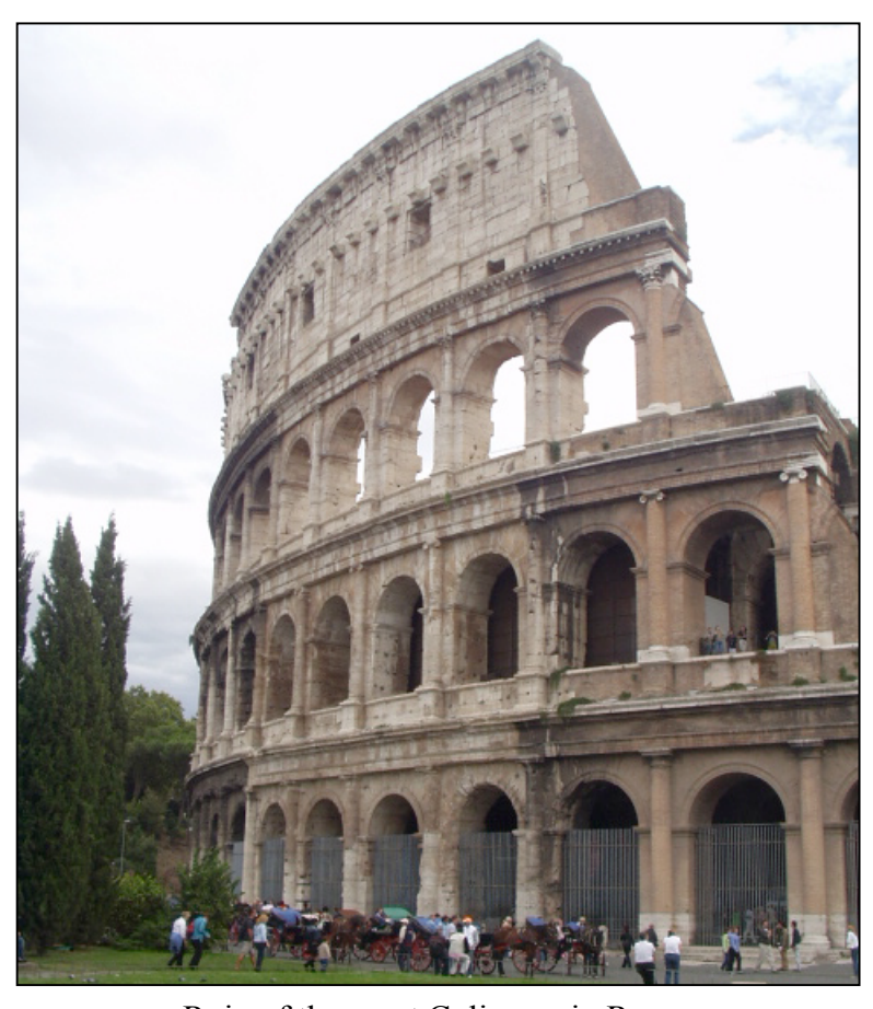
Ruin of the great Coliseum in Rome It opened in 80 CE and could seat 50,000 people.

Use the same rubric presented in Lesson 3 to assess the four brochures. If students have not completed Lesson 3, wait until they have finished it to grade the brochures. Teachers might assign points to students based only on the work that each student is responsible for. Each might receive a quarter of the points awarded for the title page. Teachers should multiply by whatever factor necessary to scale the value for their individual grading system.